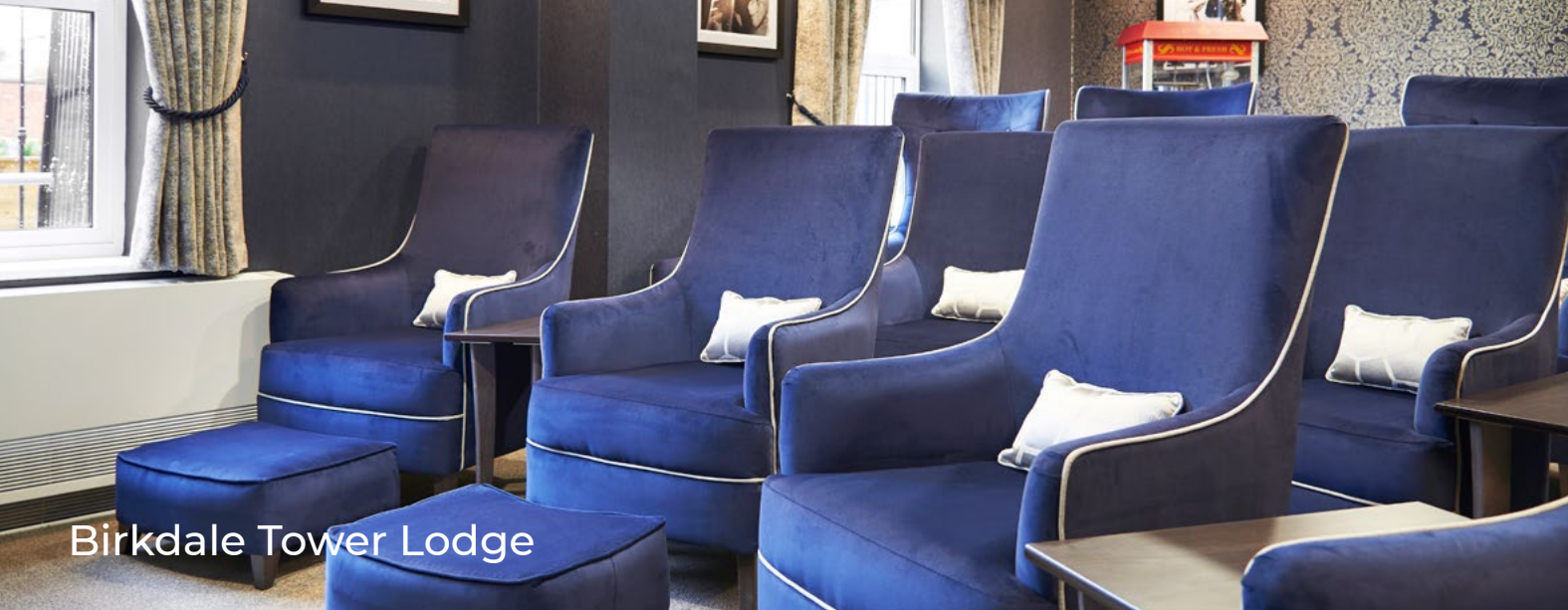
Birkdale Tower Lodge