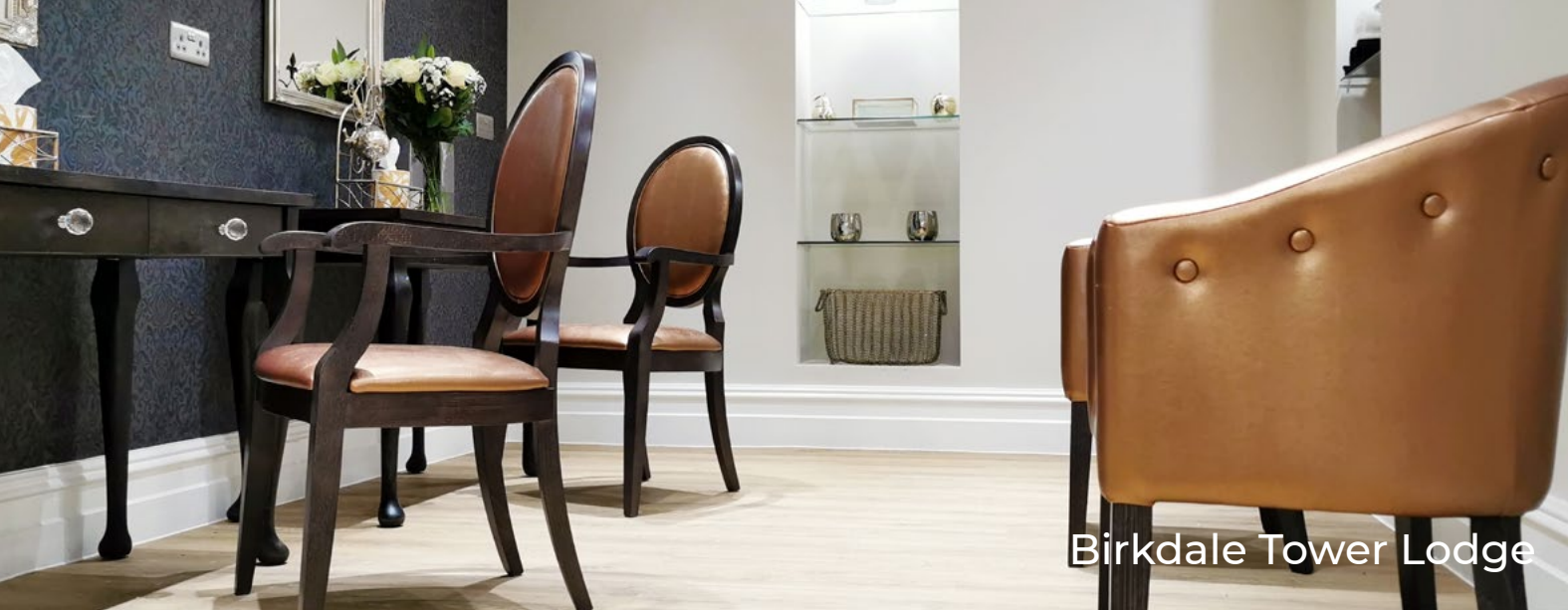
Birkdale Tower Lodge